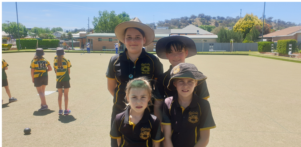
Our Lawn Bowls Team